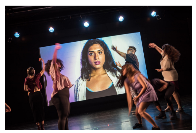
The AMY Project presents Almeida (The Glorious) at the 2017 Summerworks Performance Festival.

My understanding of what is happening in the sector is informed by many things, including having seen an institutional training program from the inside – I received an MFA in Theatre Practice – Community-Engaged Theatre from the University of Alberta. I also worked as editor-in-chief of alt.theatre , Canada's only professional journal dedicated to the intersections of politics, social plurality, cultural diversity, and the stage, where I read dozens and dozens of proposals and articles about community arts work in Canada. I've also worked as a trainer of 'community artists' through programs like Jumblies Theatre's Artfare Essentials, and a pilot program I am launching this month for IBPOC (Indigenous, Black, People of Colour) community artists, Parallel Tracks. In general, I've actively participated in community arts networks, conferences, and conversations; and of course, I'm a practicing community artist, who works with many community arts organizations in Toronto, and pays attention to sectoral trends.