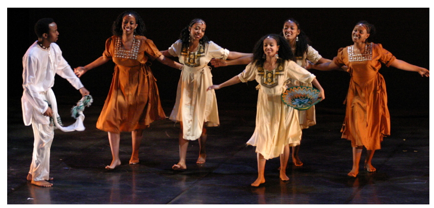
Jaivah Dance Troupe (formerly Nouvel Exposé).

Arts Movement Ontario (CPAMO), and the International Association of Blacks in Dance (IABD). Through relationships built within this network, dance Immersion has been able to promote and advocate for dance artists of African descent in a number of different ways.