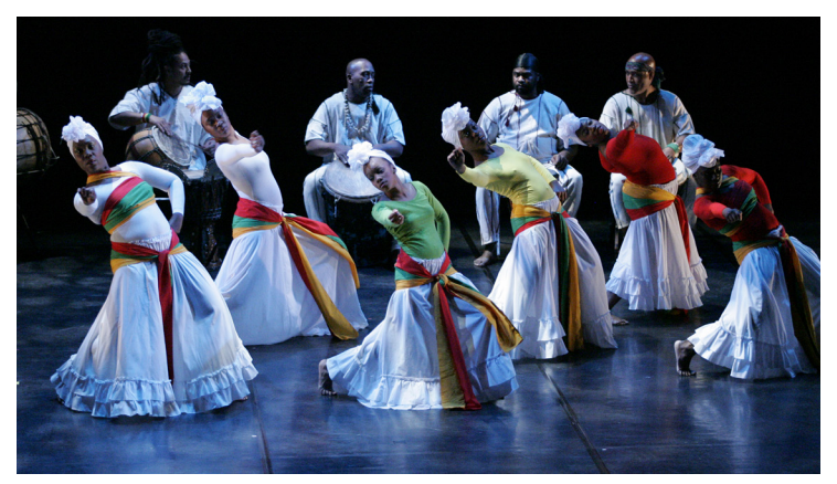
Toronto-based Caribbean Folk Performers

This path dance Immersion has chosen widely supports others who continue to advocate for our inclusivity. We honour the work of these soldiers who continue to make sure that our art does not become invisible in the world of "visible minorities." dance Immersion works with all, to define and develop within the global community, building relationships, connections and resources that feed, strengthen and bring together an artistic movement that is truly sourced from its origin.