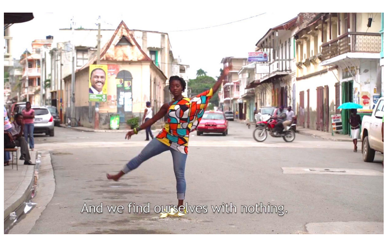
BOWT TRAIL. Chorégraphie, interprétation, mise en scène, compositions vocales et sonores (Choreography, performance, staging, vocal and sound compositions): Rhodnie Désir

Ma danse s'ancre et est indissociable de la communauté, du cercle de la vie : de la société. Le tambour est le cœur du citoyen et la parole c'est l'impulsion qui lui