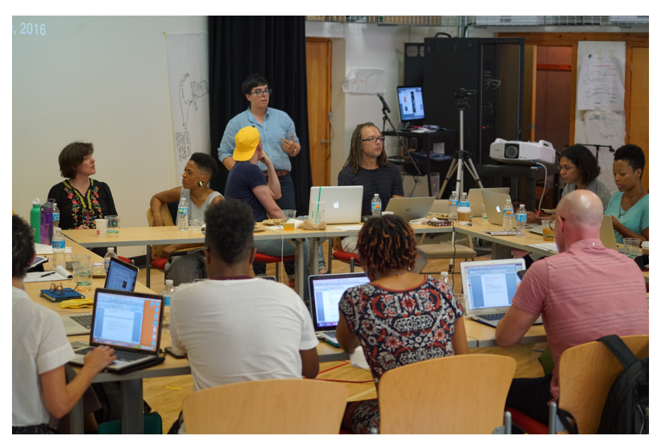
CURATING - COMMUNITIES - COLOR panel discussion, Configurations in Motion 2016, Duke University.

a radiant and wonderful feeling. This is a deeply useful way to think of the active role of curating. And, it brings us back to your suggestion that ghosts "hope for us to feel, in a progressive way, an opening to encounters with performance" and that they are "smarter than we are." This is a feeling I carry often – the one that people coming to see performance or exhibitions about performance are much smarter than I am because they know themselves better than I know them. I surrender to this fact or at least I try. As curators, don't we hope to reach just one part of a person, and if we're lucky one part that they themselves don't know is there? And we have to keep asking ourselves, who isn't here?