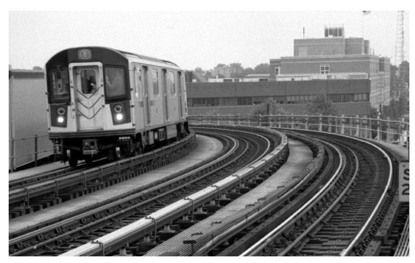
South Bronx, 2003.

are any left to be uttered, later. Robert Moses. He moves and shoves huge numbers of people out the way of his construction. A group of women take a bus south to protest against the plans to uproot their families. Yep, you guessed it. The building went on, a huge feat of engineering. The hills bowed and the engineers clapped their hands in victory, and politicians joined in the applause too, and people were moved out of sight, in a sudden rapid exit, stage right.