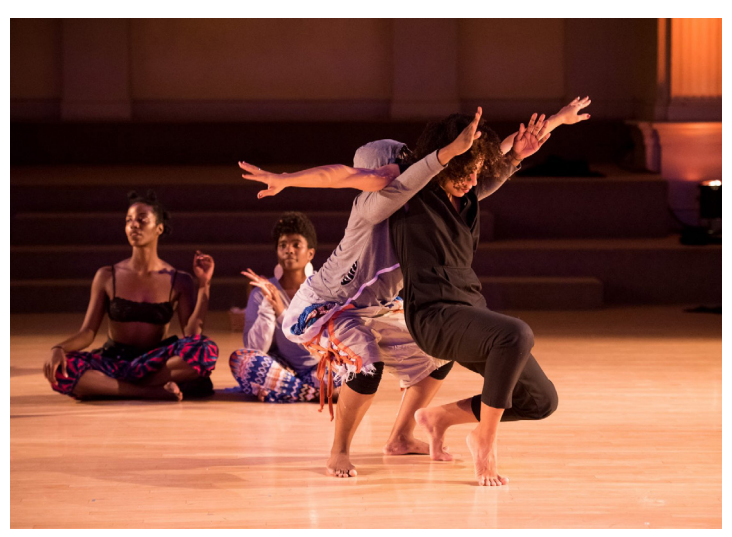
the skeleton architecture, or the future of our worlds, Danspace, 2016.

and performance artists, to a relatively traditional performance venue housed within a major contemporary art museum that responds to local and international audiences, as well as a larger network of presenters, performance makers across genres, and funders. As an active dancer and performer, I am also myself regularly in the position of those performers who are hired by the artists I will work with as a curator. So, I'm writing this in a moment of culture shock over the kinds of conversations I'm already starting to have within this new role and in anticipation of what's to come.