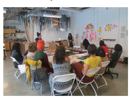
Parallel Tracks, 2017.

Another current preoccupation of mine is how to lift structural barriers that lie between IBPOC artists doing community-engaged work at the grassroots level, and community arts resources. At the end of this month, thanks to some funding