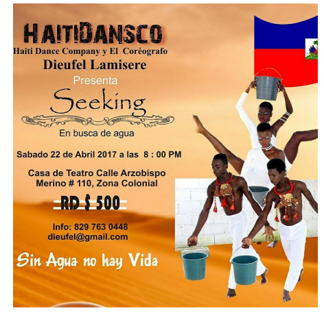
Seeking: En busca de aqua, performance flyer, 2017.

In order to make the trip happen, Lamisere had to crowdfund each step