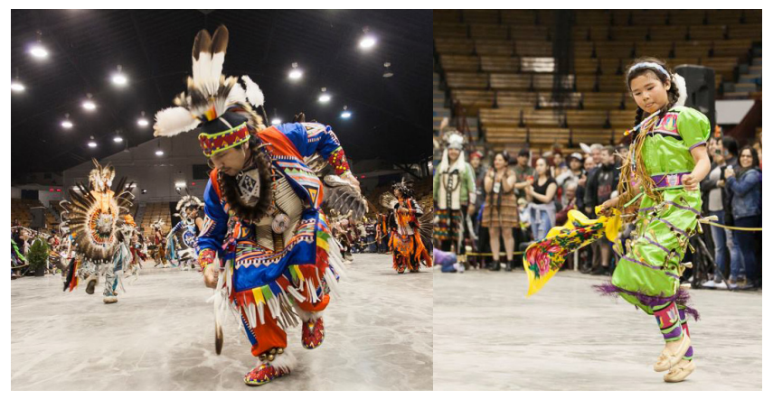
Montréal Pow Wow.

embrace one another, to learn from one another and have the common goal of peace in the world. Miigwech, thank you.